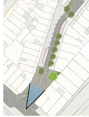
Above: plan showing viewpoint