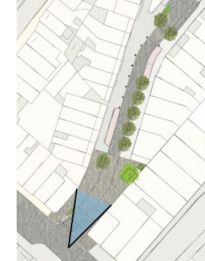
Above: plan showing viewpoint